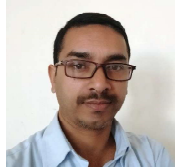
By: M.R. Lalu

Did Kantara the Rishab Shetty blockbuster take you into a rare multiplex marvel giving you a mysterious jolt? I have no words to address the unsophisticated beauty of the village life that the movie takes us through. Its religious intellectualism woven in the innocence of a bunch of forest dwelling people took me back to my childhood. I witnessed it in the movie and was reminded of the impulses of spiritual powers that the non-Brahmin priest used to be obsessed with in a particular annual ritual at our local temple. The main attraction in the annual festival of the temple used to have a huge gathering determinately assembled to witness the morning padayani that went on for hours until the non-Brahmin priest, usually representing a scheduled caste community, breaking hundreds of coconuts and howling in all four directions with unclear sounds, normally known as his symbolic communion with the divine power. Throughout his spiritual exercise the Oorali as he is called in Malayalam appears to be possessed by some supernatural powers and capable to predict matters that affect the temple and the village. Sometimes his prediction on their inside the temple premises or anything of that kind used to get sorted out in public. His revelations were taken with rapturous attention and attracted reverence of the upper caste Hindus and all devotees of the local deity without any speak of doubt.