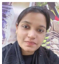
By: Samina Akhter

After mortars landed in Bangladesh's soil as Myanmar military attacks against the Arakan Army (AA) in Rakhine State, officials from Bangladesh and Myanmar's junta promised to mend bilateral ties.