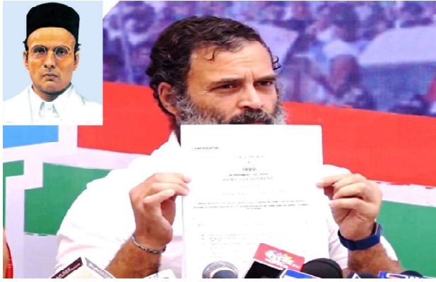
Congress MP Rahul Gandhi addressing media in Akola in Maharashtra.

"We are aware of extreme inhuman conditions Savarkar faced in the jail. Now it is time that the freedom achieved after relentless struggle is safe guarded since the country is heading towards slavery. We are intentionally asking this question by those who had earlier formed the Govt with the Peoples Democratic Party led by Mehbooba Mufti in Kashmir", Thackeray said in an appar-