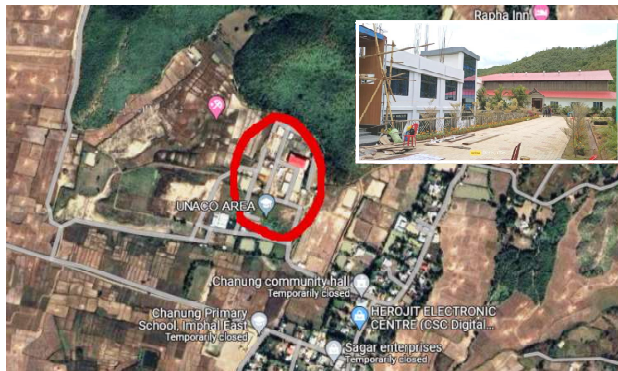
Construction of permanent structures at Chanung Village agricultural land (inset - Building)

According to a reliable source, it is learned that construction at Chanung Village in the Khundrakpam